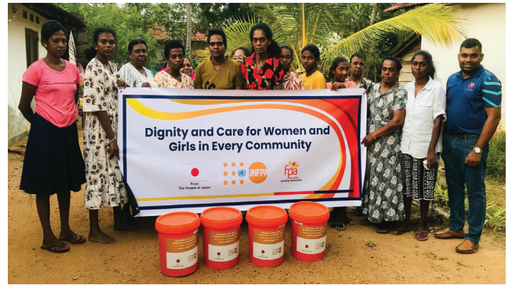
Dignity Kits to women of the African-origin community in the Puttalam District's Sirambiadiya and Good Shed areas.