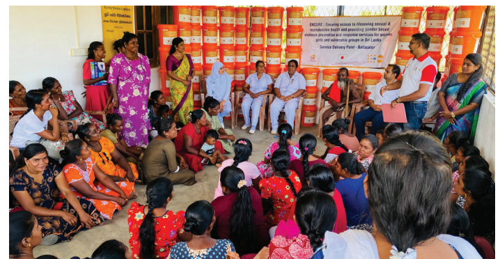
Clinics for indigenous communities in Rathugala, Mathurankulam and Pavekkodichena.