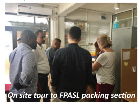
On site tour to FPASL packing section

Health, it showcased the latest in modern healthcare, disease prevention, effective treatment methods, newest technology and latest services available in Sri Lankan hospitals and laboratories as well as the global medical sector.