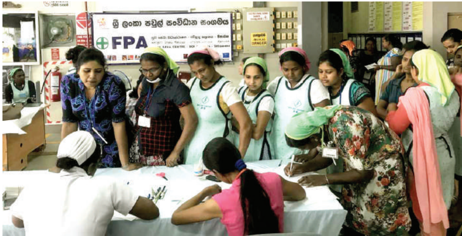
At Jay Jay Mills, Avissawella on the 8 th of March in commemoration of International Women's Day.

Our goal is to ensure that all people, everywhere, have access to high quality care and information. Through medical camps/mobile clinics, we support those who are socially excluded and/or have limited access to services.