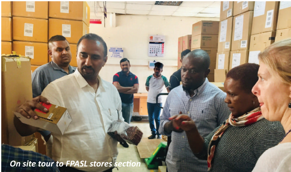
On site tour to FPASL stores section

The Social Enterprise Hub along with the Social Marketing Programme (SMP) team of FPA Sri Lanka facilitated a one day residential learning and knowledge exchange visit for a small delegation on 22 nd February in Colombo. The meeting was a technical support intervention related to Social Enterprise and Technical Assistance Network funded projects.